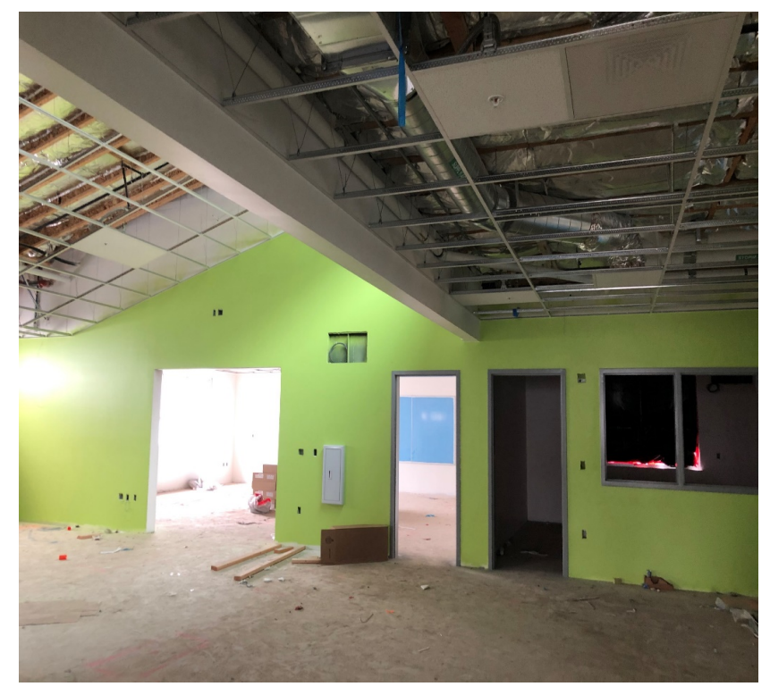
Learning Suite South with Paint Ceiling