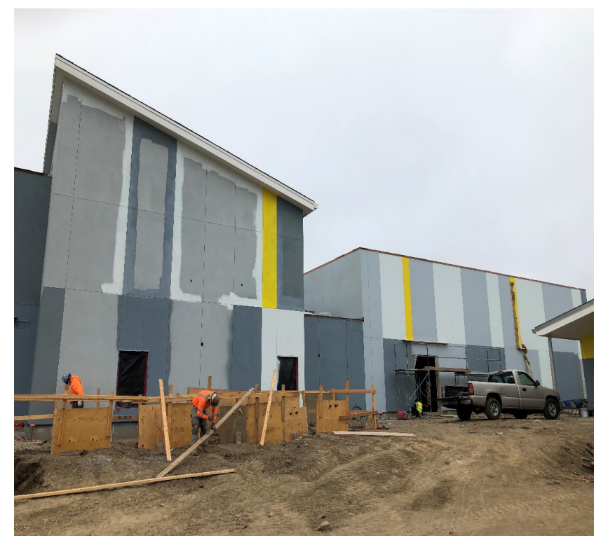
Learning Suite North and MPR Exterior Painting