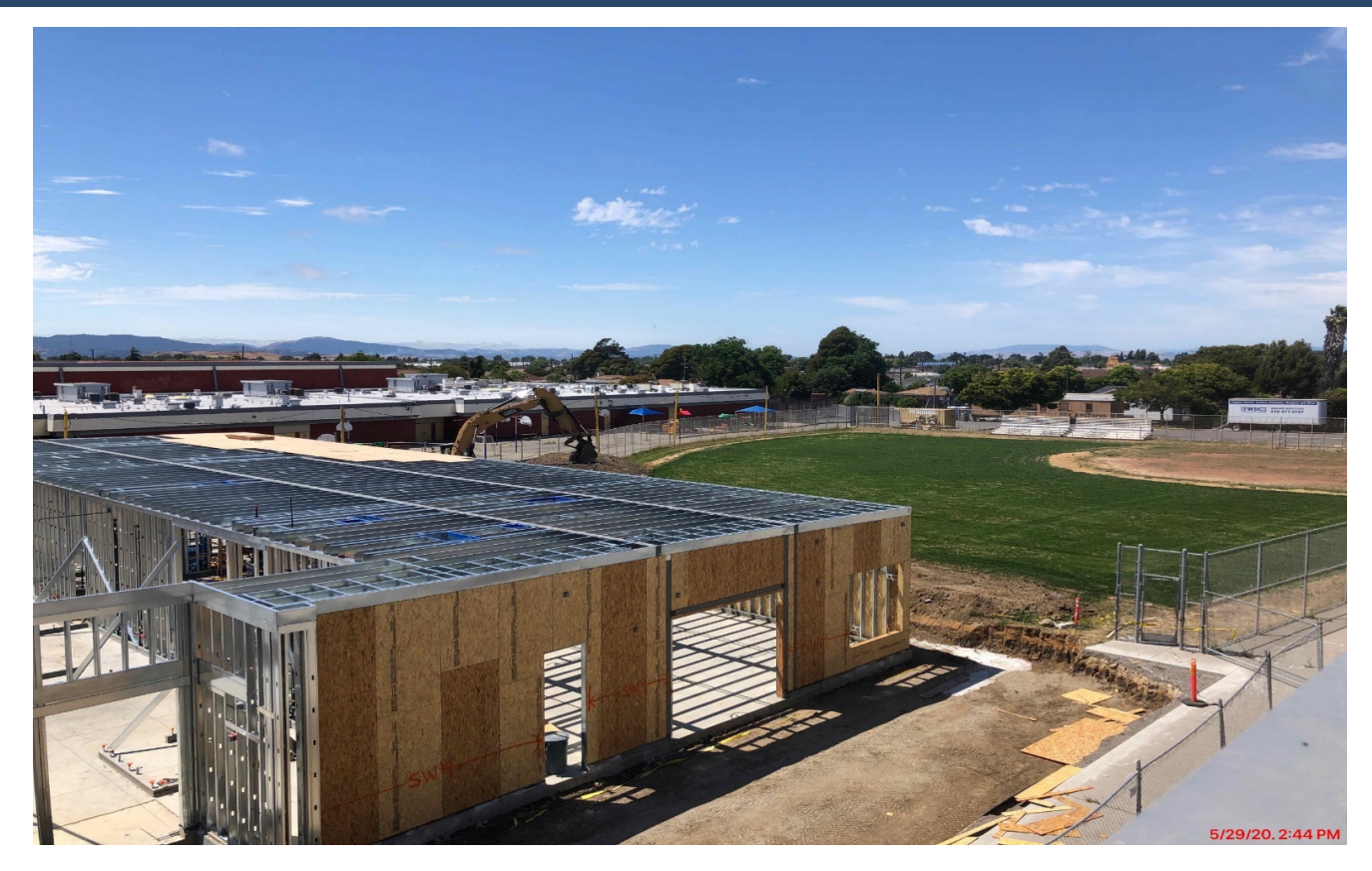
New Gym Aerial View